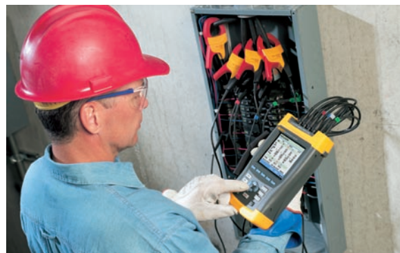
Power Quality Troubleshooting Tool

Such recording and analysis tools are also useful for conducting load studies to determine whether the existing electrical system can accommodate the addition of new loads. The measured results are analyzed later back in the office, and reports are created on a PC.