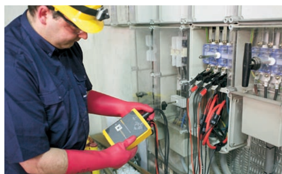
Power Quality Recording Tool