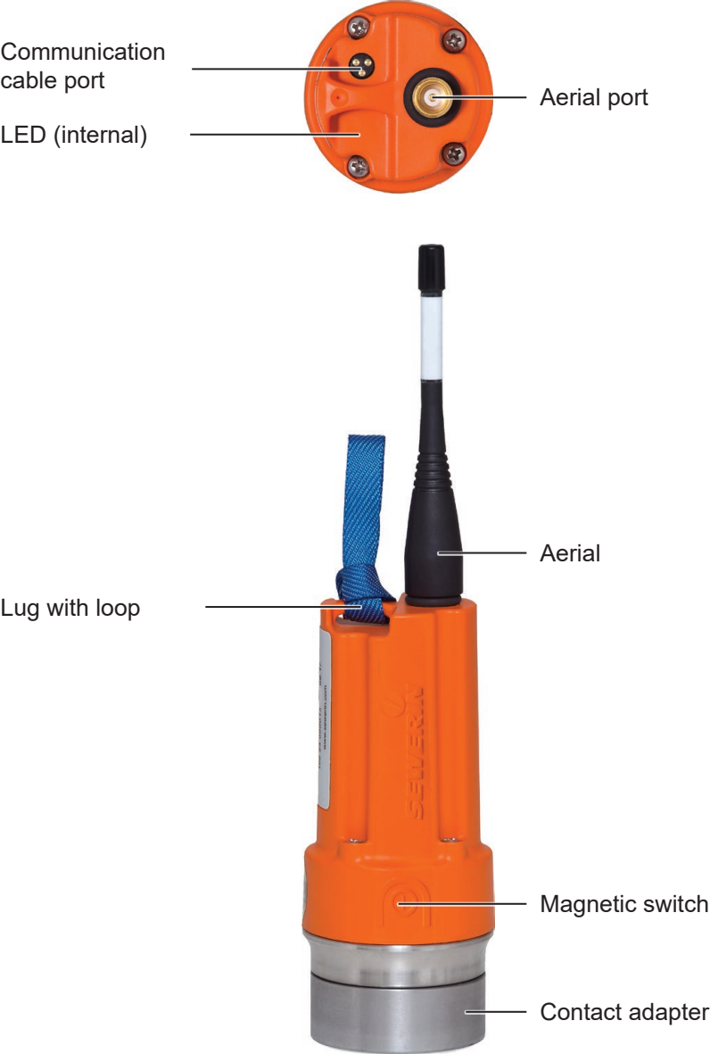
Fig. 1: SePem 351 logger