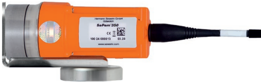
Fig. 3: Logger on installation adapter

The installation adapter consists of an angled stainless steel sheet with slotted hole and a contact adapter. The contact adapter can be pushed into the slot until the optimal position has been found for the measurement location. The contact adapter is then fastened with a nut. The logger is attached to the short part of the sheet.