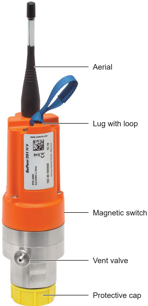
Fig. 2: SePem 351 HY logger