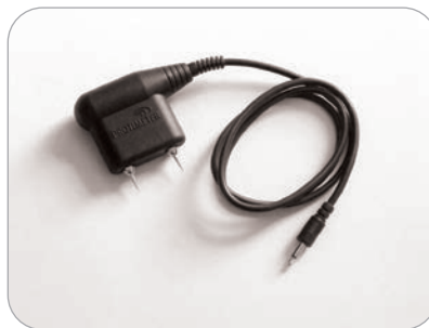
BLD5060 Heavy Duty 2-Pin Probe