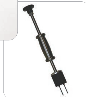
BLD5055 Heavy Duty Hammer Probe