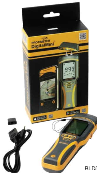
BLD5775 - Digital Mini Standard Kit