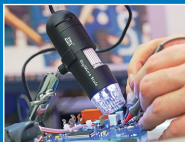
Onderhoud, reparatie en kalibratie