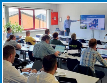
Trainingen en seminars