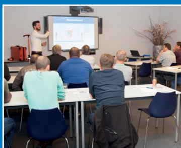
Seminars en workshops