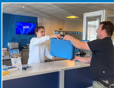
Comptoir de service