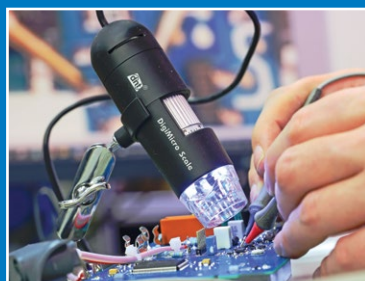
Entretien, réparation et calibrage