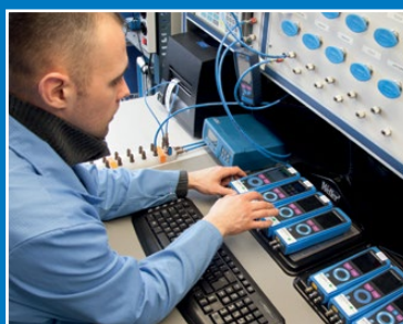
Calibrage de l'analyse de gaz de combustion