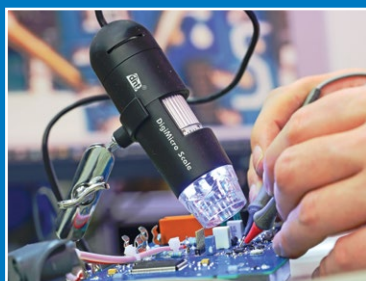
Entretien, réparation et calibrage