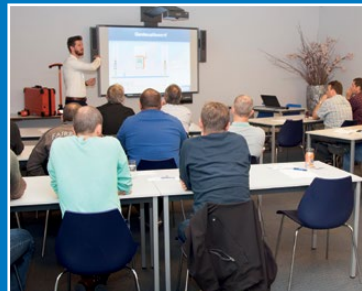
Seminars en workshops