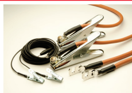
6220-755 5m Lead set (600 A)

2 x 50 mm 2 current leads with clamps and 2 x potential leads with clips.