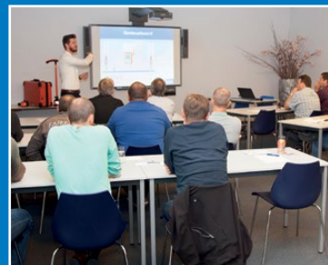
Seminars en workshops