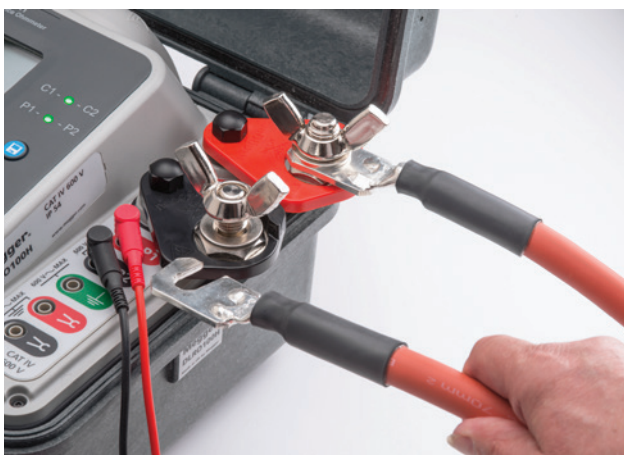
A new terminal adapter has been designed to enable the use of users own test leads.

DualGround™ capability with the DC clamp