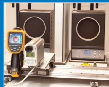
Calibrage de la thermographie

Sous réserve de modifications EURO-INDEX® FR 18001