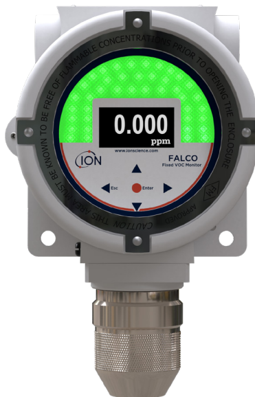
Diffused 10.6eV model

Registering your product online within one month of purchase will extend its warranty.