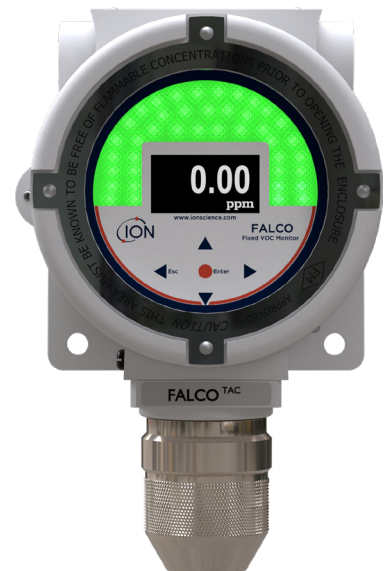
Diffused TAC (10.0eV) model