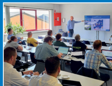
Trainingen en seminars