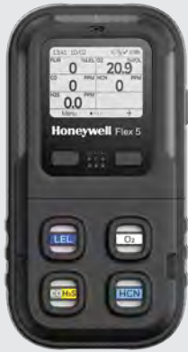
Flex 5 Diffusion Gas Detector Configured to Detect 5 Gases