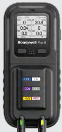
Flex 5 Pumped Gas Detector Configured to Detect 6 Gases