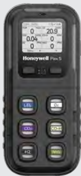
Flex 5 Diffusion Gas Detector Configured to Detect 6 Gases

This approach supports higher throughput, more predictable maintenance, and lower total cost of ownership over the life of the device. Safety Suite 2.0 extends this value by turning service and fleet data into actionable insights that support long term program scalability.