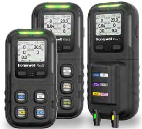
Flexible configuration supporting up to six gases

Your Fleet. Your Way. Designed to Be Ready