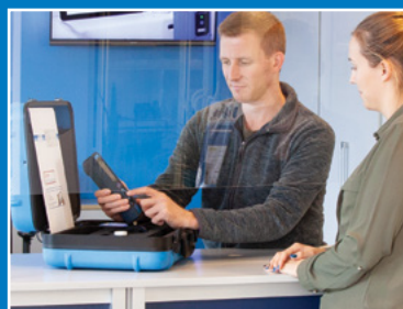
Comptoir de service