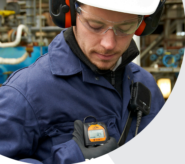
Cub TAC personal PID monitor worn to provide continuous detection.