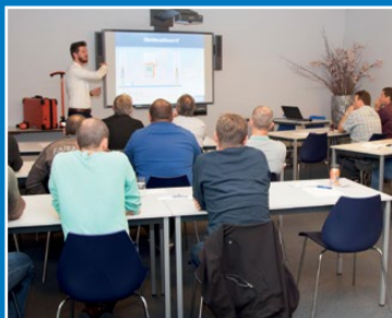
Seminars en workshops