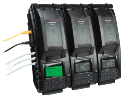
IntelliDoX automated instrument management system