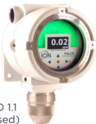
FALCO 1.1 (Diffused)