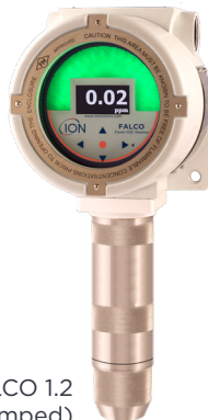
FALCO 1.2 (Pumped)

Certification: Intrinsic Safety and EX d ATEX, IECEx, North American and Canadian standards