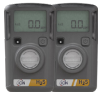
ARA H 2 S ARA H 2 S Hibernation

ARA Single Gas Detectors comprises six models including four gas types: Hydrogen Sulphide, Carbon Monoxide, Oxygen and Sulphur Dioxide.