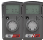
ARA CO ARA CO Hibernation